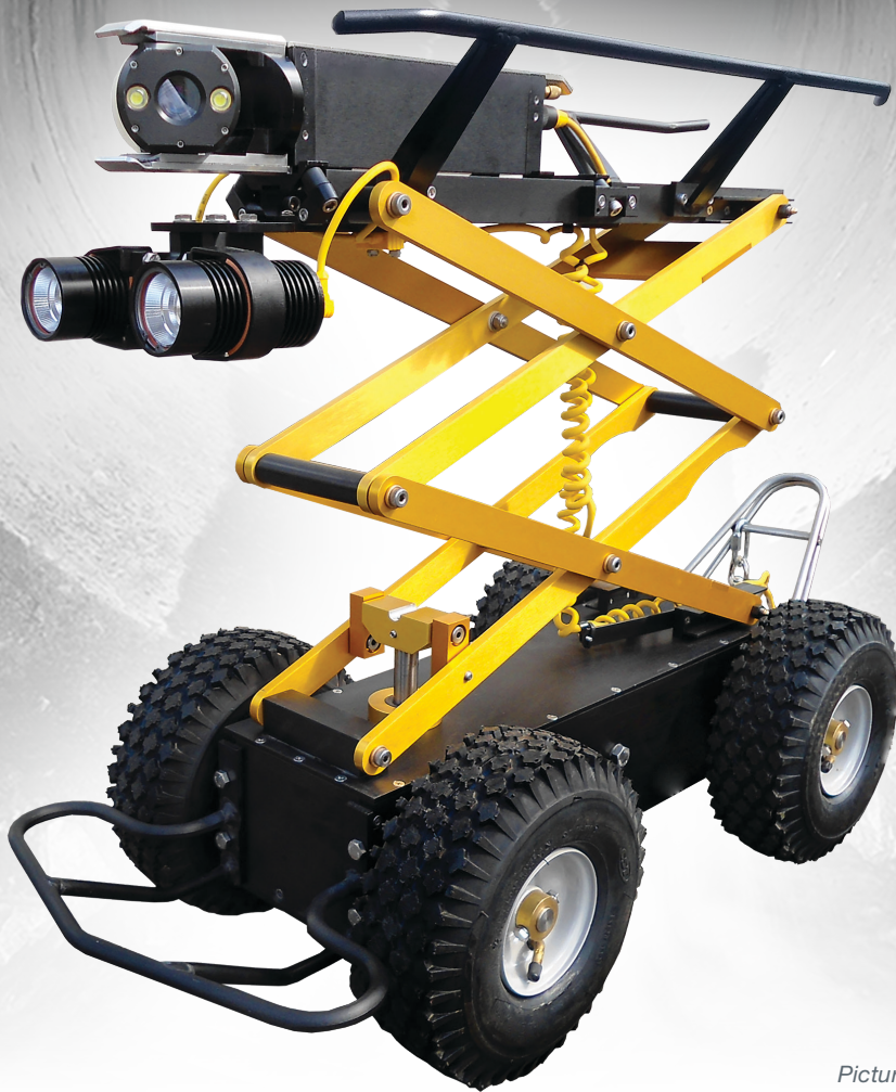
Pictured with TrakStar Camera

This steerable four-wheel drive transporter is the perfect solution for inspecting storm drains, sewer, and water pipes 24 inches and larger. The powerful tractor can achieve speeds up to 70 feet per minute and supports up to 3,000 feet of single-conductor cable. Its remote-controlled, motorized camera lift enables the camera to be centered in pipelines up to 60 inches in diameter. The Steerable Storm Drain Tractor is compatible with all Subsite's mainline cameras.